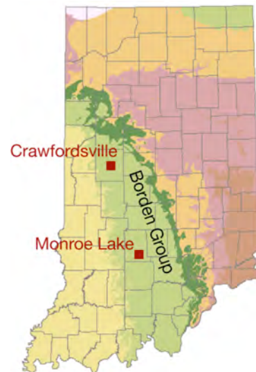
Figure 4. Bedrock of Indiana colored by geological age. Borden Group and other Mississippian aged rocks are light green.