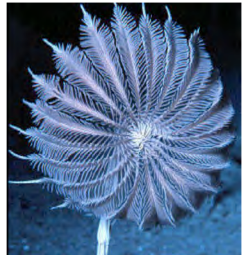
Figure 2. A living crinoid with its arms spread.