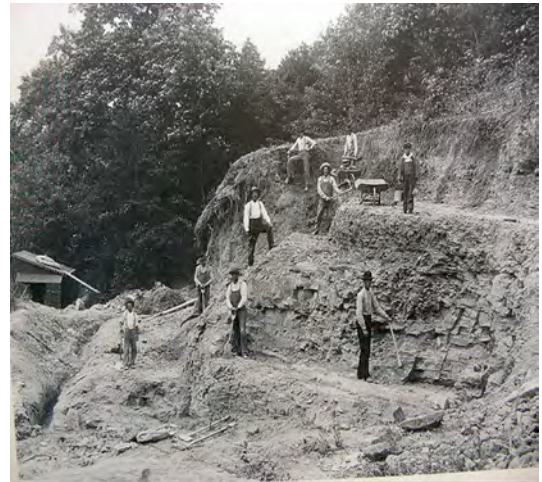
Figure 3. Crinoid quarry at Crawfordsville in 1906.